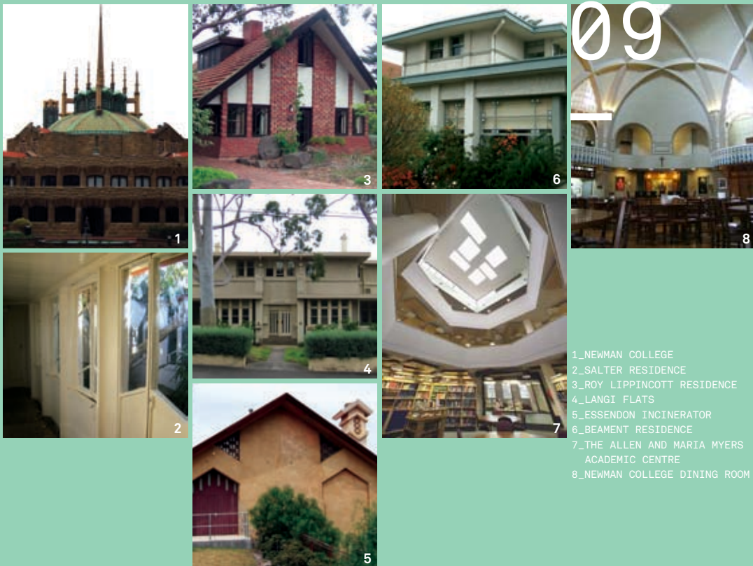
1_NEWMAN COLLEGE 2_SALTER RESIDENCE 3_ROY LIPPINCOTT RESIDENCE 4_LANGI FLATS 5_ESSENDON INCINERATOR 6_BEAMENT RESIDENCE 7_THE ALLEN AND MARIA MYERS ACADEMIC CENTRE 8_NEWMAN COLLEGE DINING ROOM

Lunch will be available in the Newman College dining room. See overleaf for details